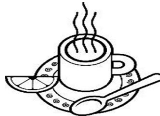
Tea & Coffee Packets

Come Join the FUN! JUNIOR CHOIR Starts February 5 th , after CHURCH!