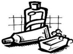
Personal Products To Share

Carleton University Chaplaincy is asking for donations of individually wrapped tea and coffee packets to share with students in the chaplaincy office. Please be generous and help our students!